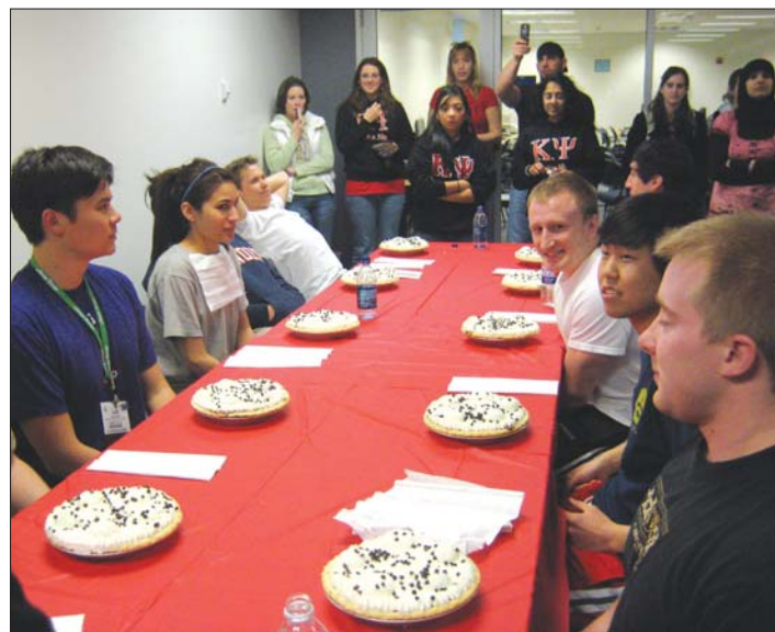
Delta Nu pie extravaganza.