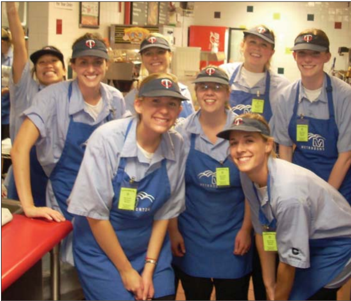
A group of Epsilon brothers working hard at the Minneapolis Metrodome during a Twins game to fundraise for the chapter.