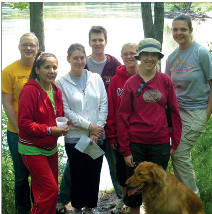
Epsilon brothers enjoying the great outdoors on their annual weekend camping trip.

E Epsilon University of Minnesota Founded 4/30/1928 College of Pharmacy 5-130 Weaver Densford Hall 308 Harvard Street S.E. Minneapolis, MN 55455-0343