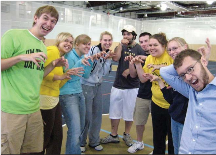
Delta Omicron pledges, aka "the Cats," get into the spirit of team building.