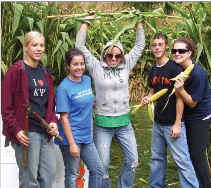
Beta Kappa brothers have fun at the corn maze.

Ballpark. The tailgate party consisted of barbecue burgers and wiffle-ball fun in the park just around the corner from the game. First-year students were surprised with a third quarter scoreboard announcement welcoming the "UCSF Kappa Psi Rush 2008!" The Vegas Game Night rush event was also a big success as board games, karaoke, poker, and Wii kept all entertained long into the night.