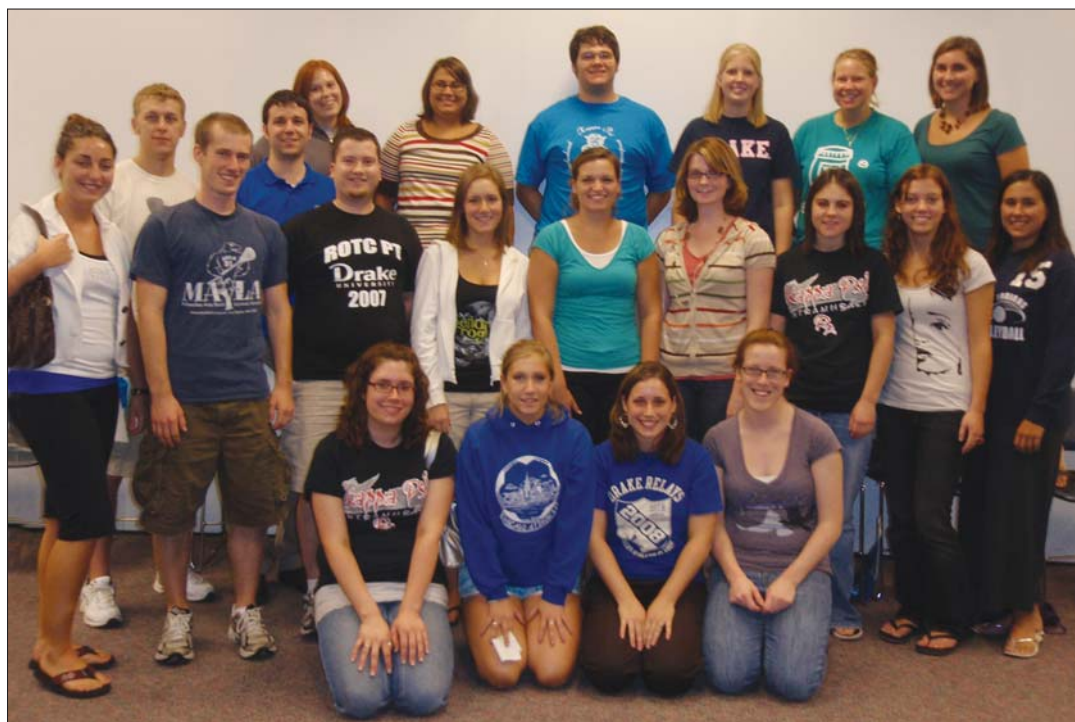
Beta Chi brothers who received academic honors of president's list and dean's list spring 2008.