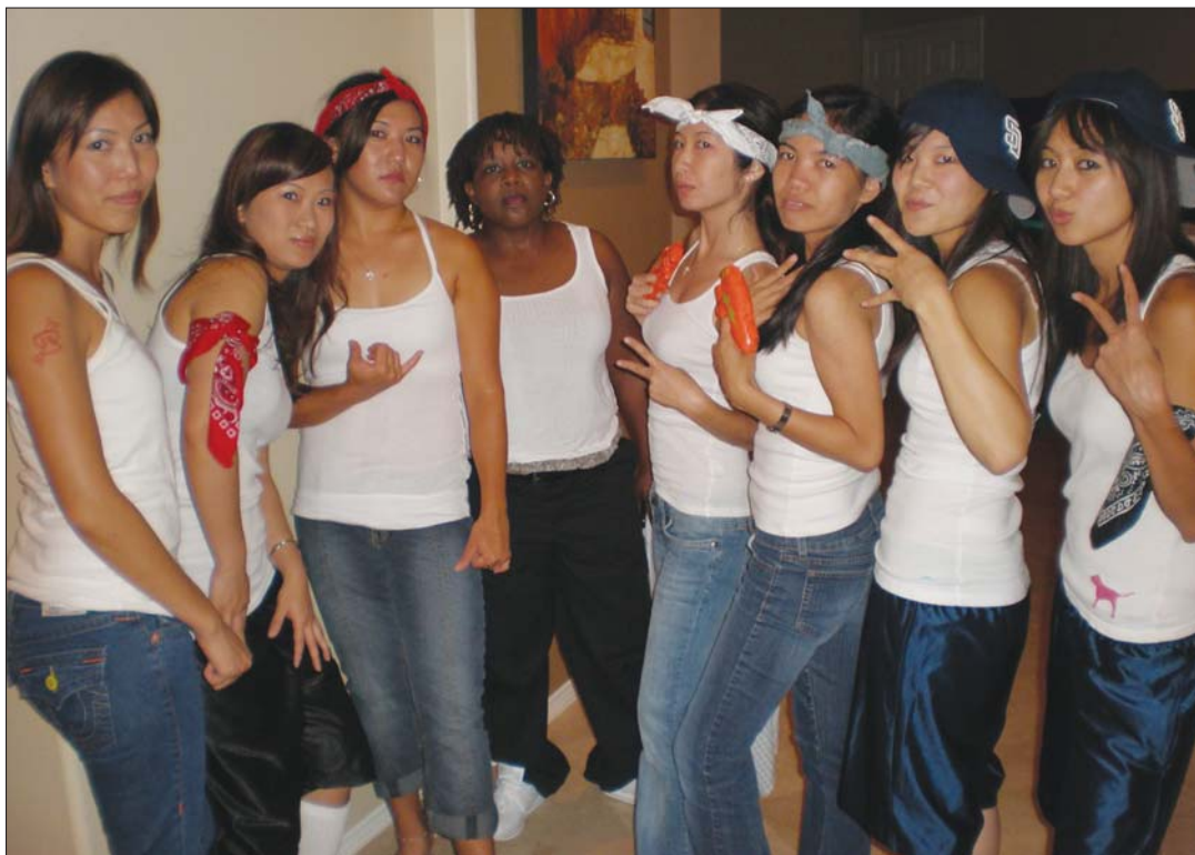
Epsilon Gamma's Founders' Day gangster theme party.