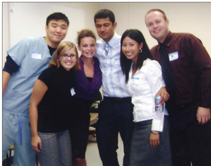
Beta Psi actives get ready for formal rush.

next rush event was our ever-popular "How to Succeed in Pharmacy School" lecture. Many new students came eager to learn anything that would help them get through the next four years. The rest of the week included a luncheon with pizza served in our Pharmacy Lounge, a Clam Bake at the Kappa Psi house, and our most attended event, the Graffiti Party. The next week we concluded rush events with a mini-golf outing at Adventure Landing.