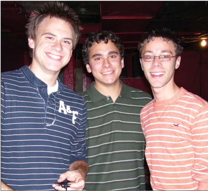
Beta Kappa brothers model their stripes.

their little brother. We are pleased to start this year by initiating 32 new brothers to our chapter! Rush Week rushed on by but it was filled with memorable events. It included informational meetings, a campus scavenger hunt with a rewarding ice cream social at the end, and bowling night with a twist of "Special Olympics." We finished off the Rush Week by inviting the new initiates and returning brothers to a colorful and vibrant luau-themed initiation party.