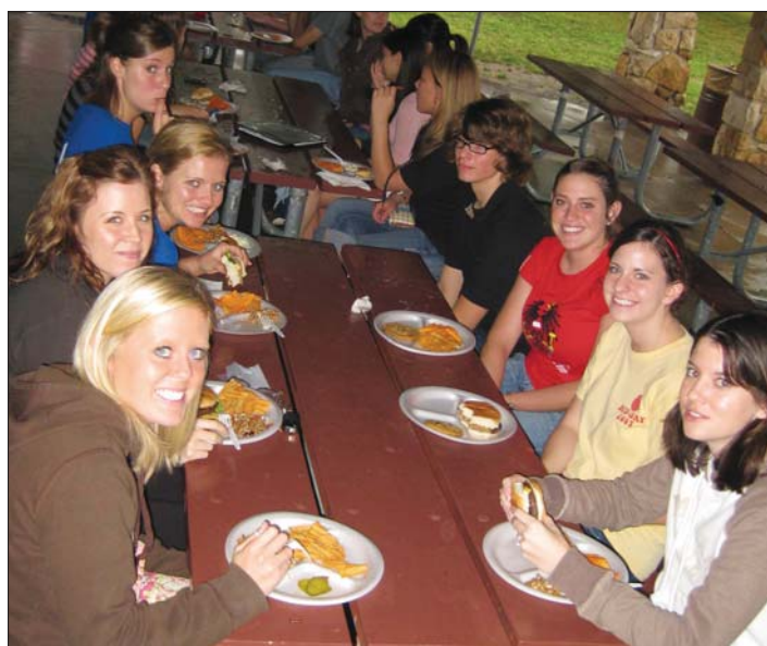
Rho chapter hosted a night of a barbecue for those interested in joining Kappa Psi.