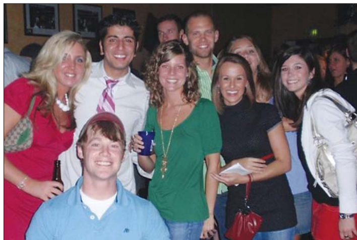
Psi chapter pledges and brothers raised more than $1,000 for the Make-A-Wish Foundation at their date auction.

still focus their efforts on important projects for the profession and the community. Brown bag training and sessions have been scheduled and planned, and Kappa Psi is poised to reach out to the community to further the development of the Personal Medication Record. Sigma designed a special decal to alert EMTs and other emergency response workers about patients participating in the PMR program. It is not difficult to see that brothers here are getting back into the swing of things, pushing forward as usual.