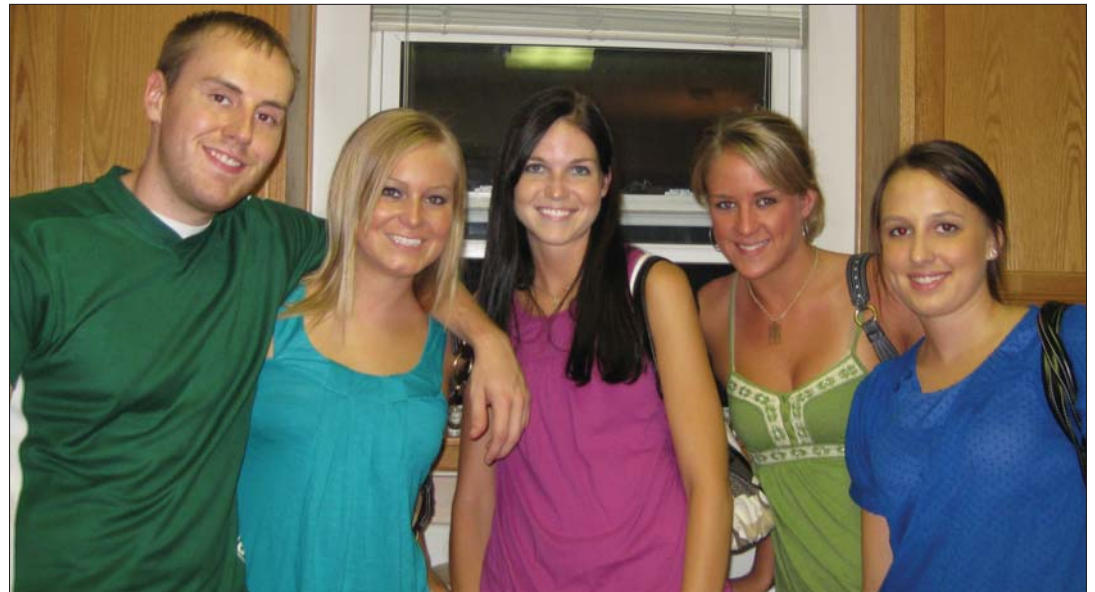
Rho chapter brothers enjoyed a night of burgers and chicken at a Back to School Barbecue.