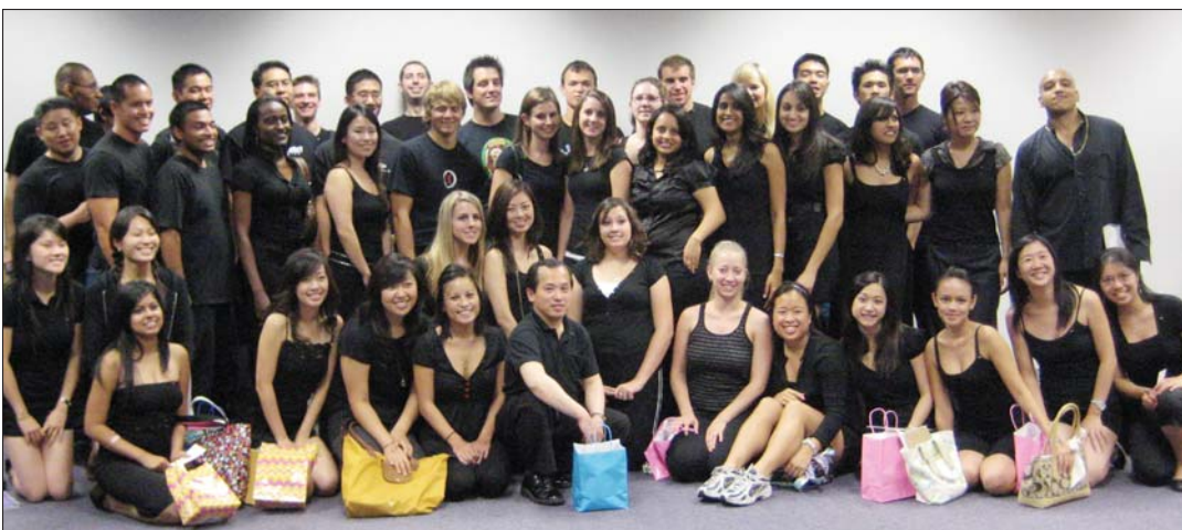
Delta Sigma brothers all dressed up.

This summer Delta Psi sent three of our officers off to a leadership retreat where they worked on creating a mission statement for the chapter while building their leadership skills. The chapter also sent a couple of brothers to help at Camp Wheeze-No-More for children with asthma. In addition, the brothers of Delta Psi had monthly get-togethers for fellowship and to continue to maintain their close friendships. Once everyone returned to campus, Kappa Psi held a barbecue at a local park the weekend that the College of Pharmacy had pharmacy days in Duluth for both the Minneapolis campus and the Duluth campus. We are excited to have 11 new pledges interested in becoming our brothers and are starting the pledging process. This semester will be a busy one. We are holding a Texas Hold'em tournament in October