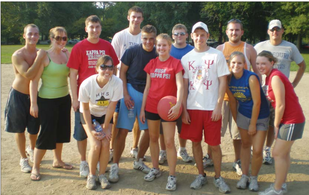
Gamma Pi brothers playing kickball to raise money for YMCA.

In the balancing act of community service, academics, and fundraising, our chapter's still finding some time to have fun. We're continuing our weekly "Brother Night" tradition, dealing up a few games of poker and enjoying the nice weather down by the river before winter sets in. With homecoming only a couple of weeks away, we are actively setting up our traditional dinner at the Holiday Inn, as well as our annual post-dinner gathering.