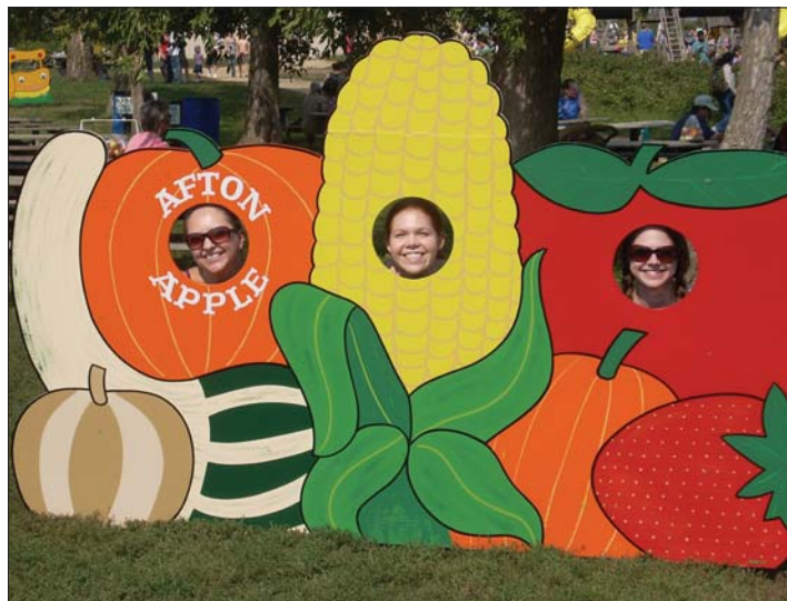
A few Epsilon brothers having fun at the Afton Apple Orchard.

In San Francisco, September, October and early November herald an “Indian Summer” of sunny blue skies and warm clear nights—the perfect weather to kick start a lineup of exciting new events and time-tested traditions that further strengthen the Kappa Psi Brotherhood here at UCSF. Over the summer, Beta Gamma was in attendance at the Province Interim Meeting recently held in Albuquerque, New Mexico, and as always, was inspired by the strong