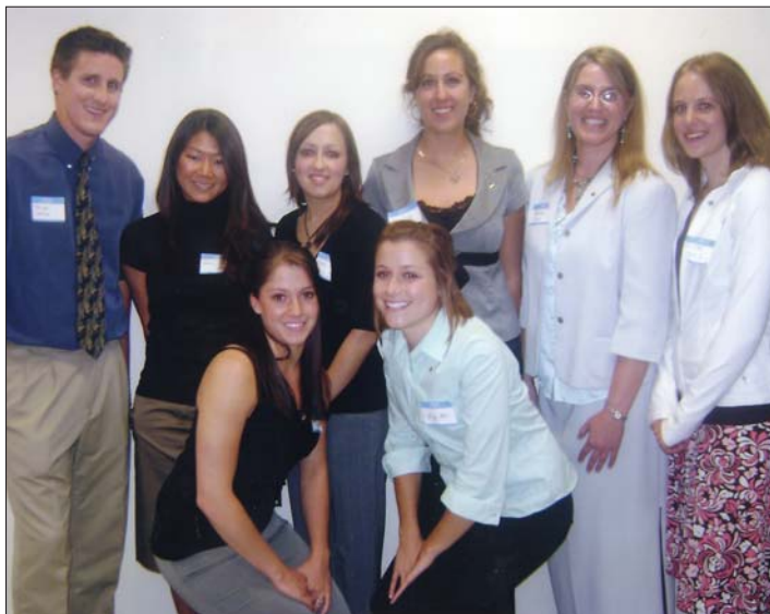
Beta Psi's fall pledge class.