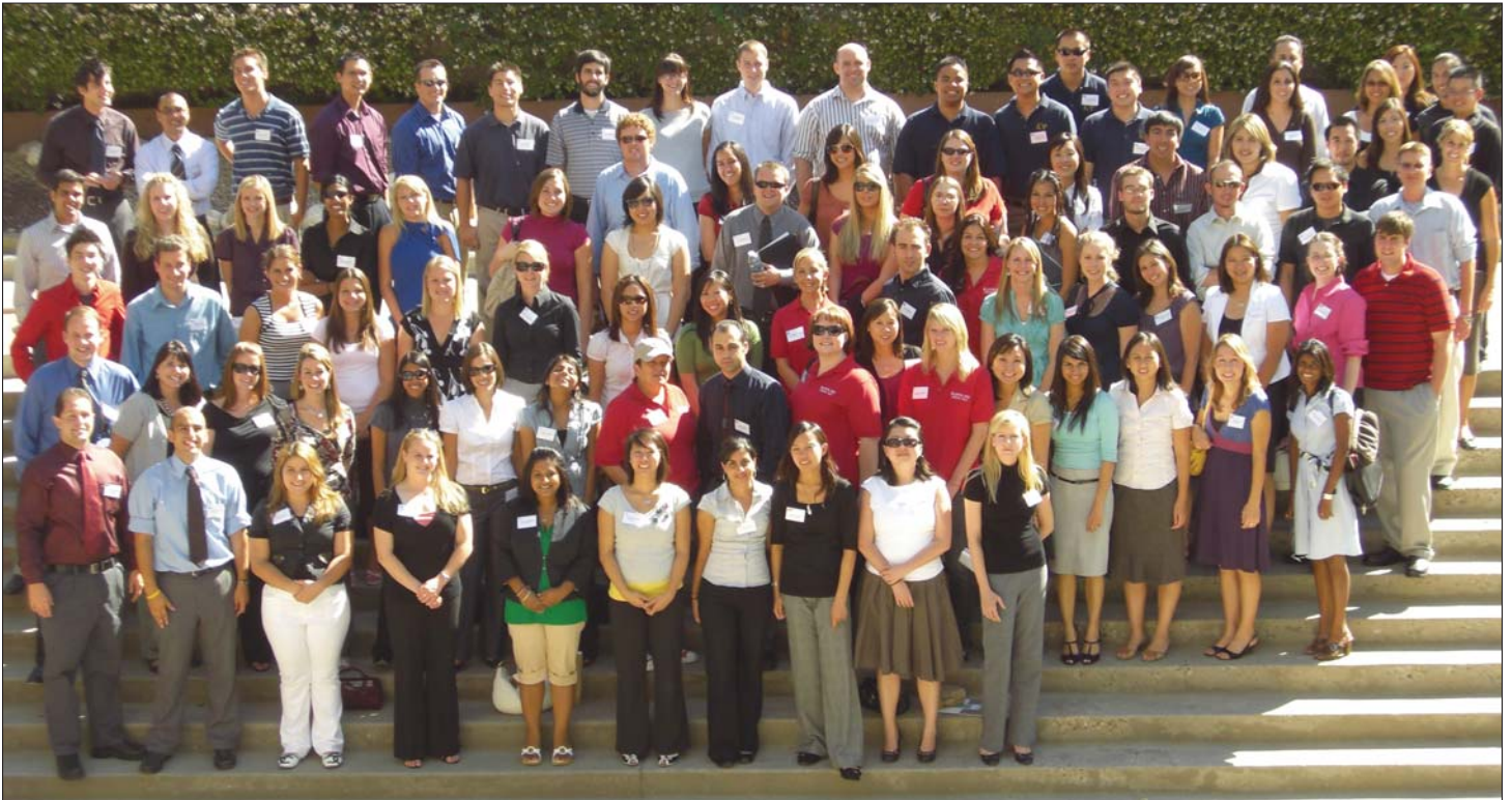
Province IX meeting recently in New Mexico.