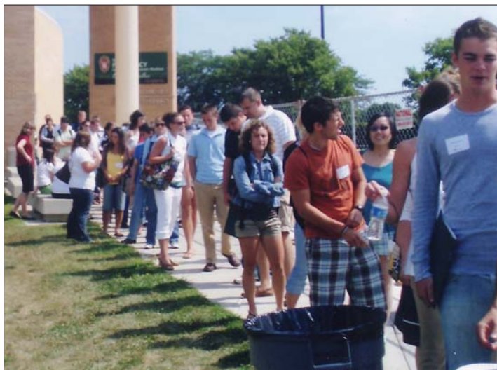
Beta Psi first-year pharmacy students line up for Kappa Psi's annual orientation cookout.